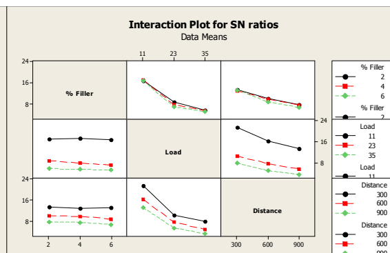
Figure 2. Interaction Plot.