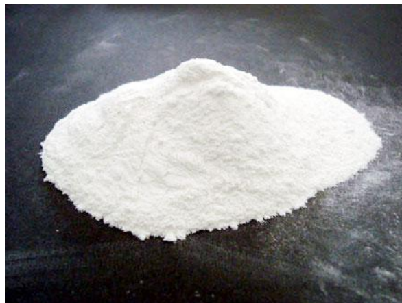
Figure 1.2 Powdered Marble

Unadulterated white marble is the consequence of transformative nature of an extremely immaculate (silicate-poor) limestone or dolomite protolith. The trademark whirls and veins of colourful marble assortments are generally because of different mineral contaminations, for example, earth, residue, sand, iron oxides, or chart which were initially present as grains or layers in the limestone. Green shading is frequently because of serpentine coming about because of initially high magnesium limestone or dolostone with silica pollutions. These different contaminations have been prepared and recrystallized by the extraordinary weight and warmth of the transformative nature.