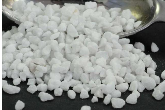
Figure 1.1 Pulverized Marble